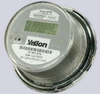
Vision & Vision LT