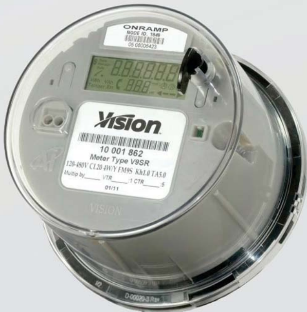
Vision XT Version

At Vision Metering, customer input has dictated the specifications upon which our meters were designed and manufactured. Our meters continue to evolve based on the expectations of our customers.