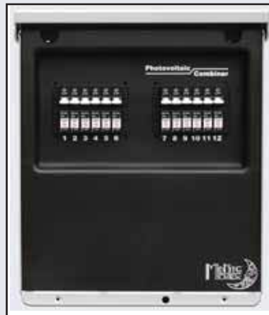
Configured for 150VDC Breakers (Offgrid)