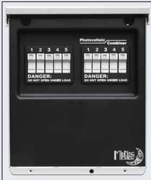
Configured for 600VDC Fuses (Gridtie)