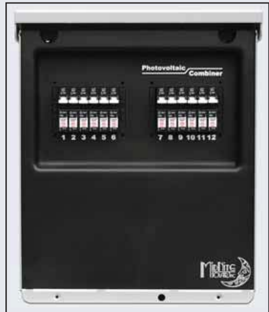
Configured for 150VDC Breakers (Offgrid)