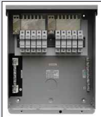
Configured for 600VDC Fuses (Gridtie)

Snap in adapters are included for use with fuse holders for a professional fit and finish. Breakers/fuse holders sold separately. Boxed size: 16 x 14 x 5 Weight: 8 Lbs.