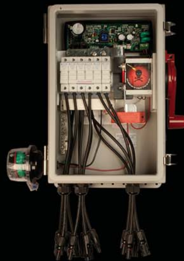
Pre-wired Disconnecting PV Combiner - MNPV6HV-MC4