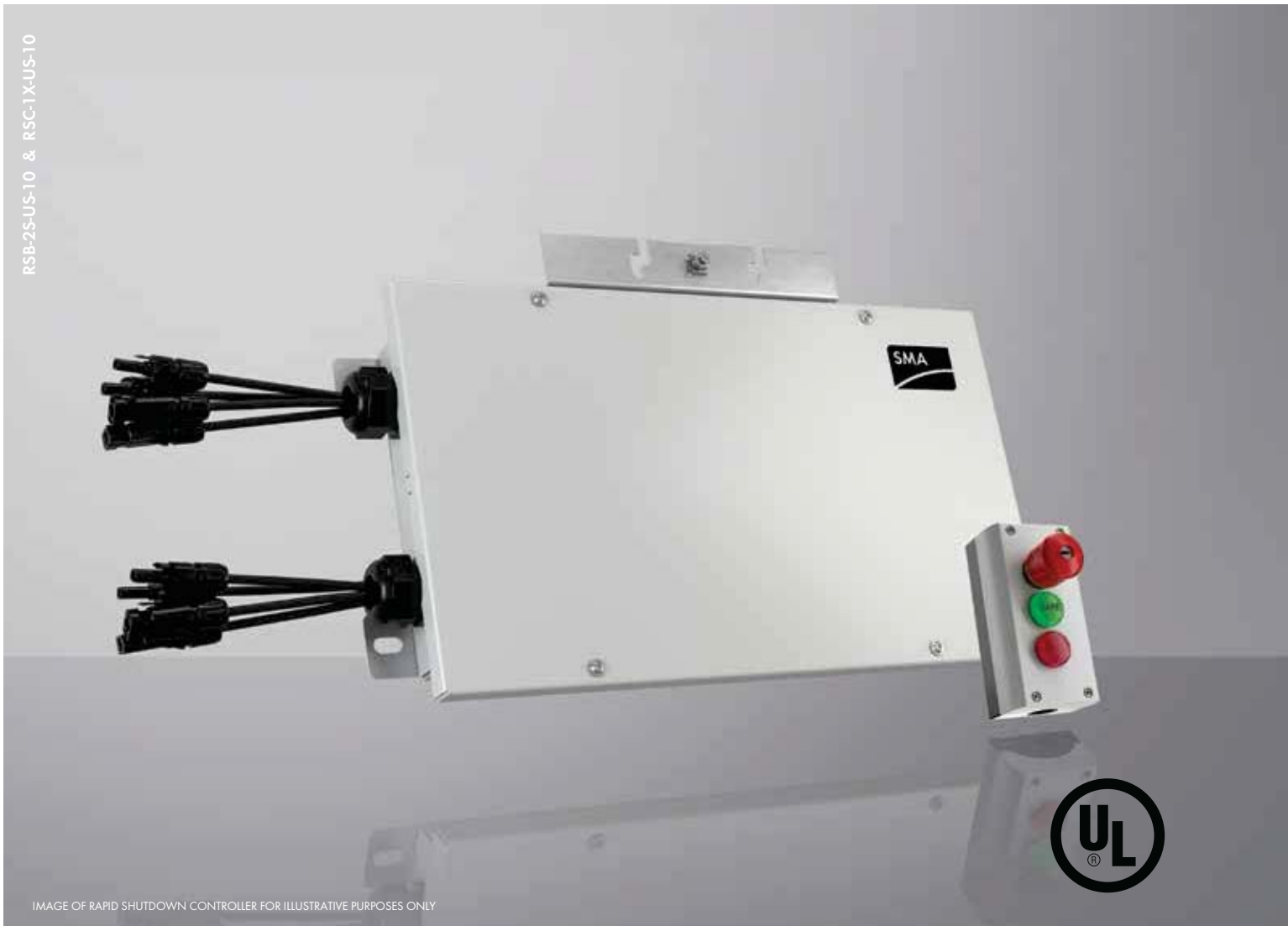
IMAGE OF RAPID SHUTDOWN CONTROLLER FOR ILLUSTRATIVE PURPOSES ONLY