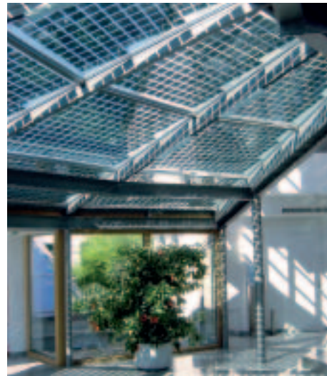
Aluminium skylight construction – internal view. 147 m 2 module surface

The system components of the mounting system have been tested for structural strength. The appropriate certificates can be provided on request.