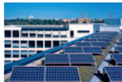
PV-Light flat-roof construction with a total output of 20 kWp