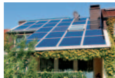
Premium complete roof construction, 22 modules and integration of a roof window

Semi-transparent solar cells in some modules are particularly striking as they allow the sunlight to shine into the building and thereby generate electricity. Façades and skylights therefore have an additional active energy-saving function