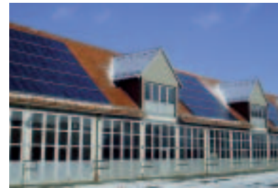
PV-Light on-roof construction with 120 modules

In addition, only inverters with at least 96 % efficiency are available. This system efficiency guarantees maximum utilisation of solar energy, consistently high yields and the highest possible return over many years.