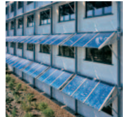
234 frameless modules with a total output of 45 kWp in a special canopy construction