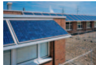
Premium canopy construction with a total output of 7 kWp

Schüco photovoltaic systems allow solar power to be used for various AC and DC electrical devices as well as generator-supported hybrid systems and backup systems for emergency power supply.