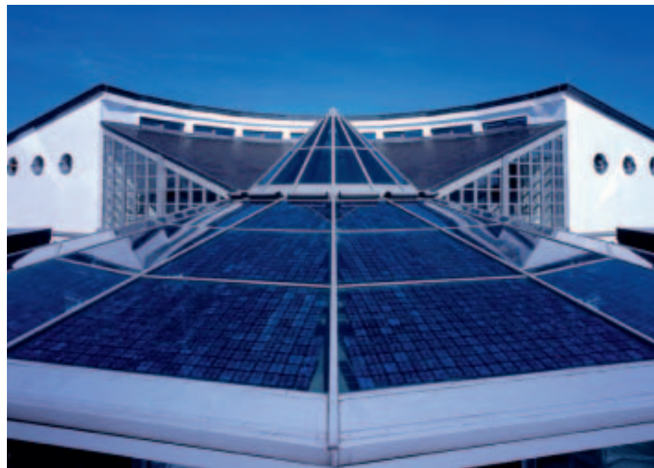
Aluminium skylight construction – external view. 60 modules in 20 different sizes with a total output of 11 kWp