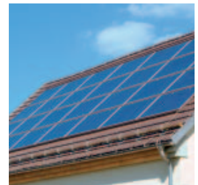
Premium in-roof construction with 28 modules and a total output of 9 kWp