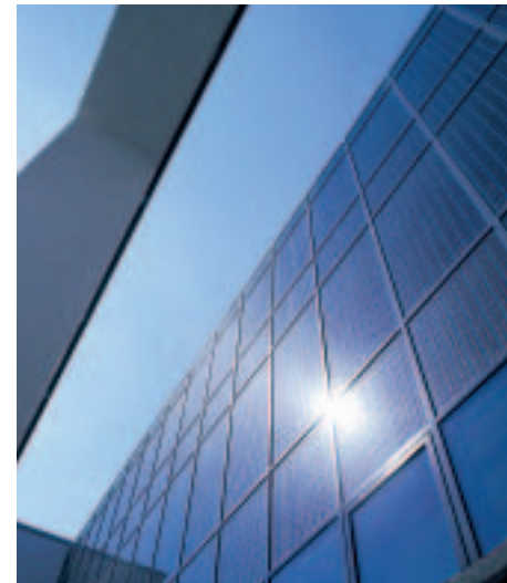
Aluminium façade construction. 600 m 2 module surface