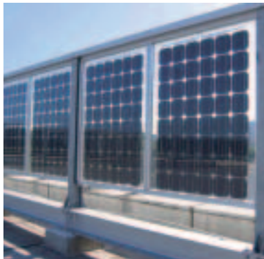
Bifacial photovoltaic modules, inserted in a free-standing spandrel panel